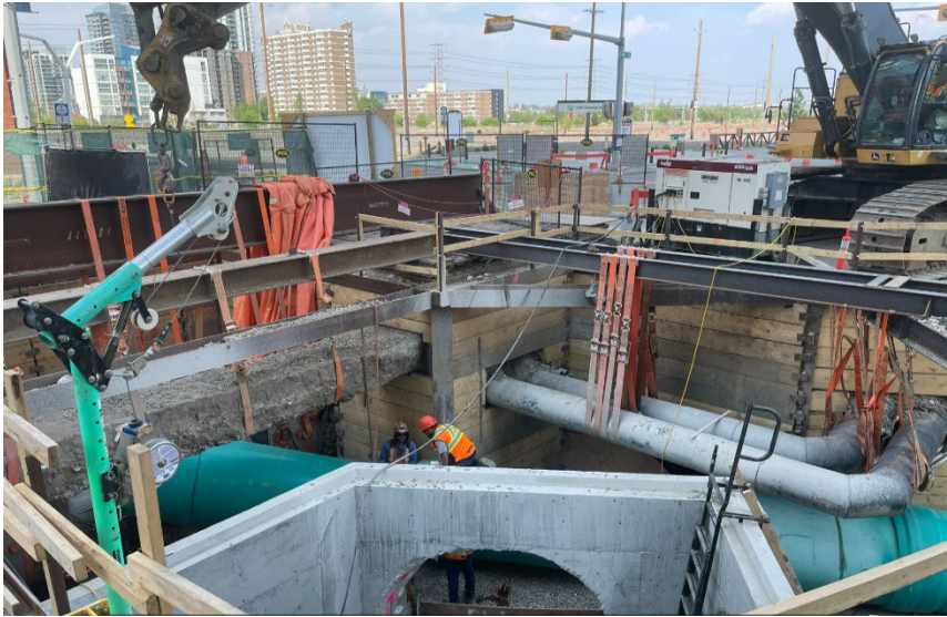
Looking northeast at deep utility relocation work at the intersection of Olympic Way and 11 Avenue S.E.