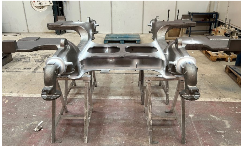
Bogie frame fabrication and welding inspections underway, the bogie will form part of the larger wheel set for the new trains (where motors, wheels, brakes, and suspension are attached).

Construction activities in Beltline and Downtown continued during the month of March. Green Line continues to work to minimize construction impacts to the travelling public and coordinate construction activities among third-party utilities, PCL who is managing BDURP construction activities on behalf of Green Line, and The City's Mobility business unit.