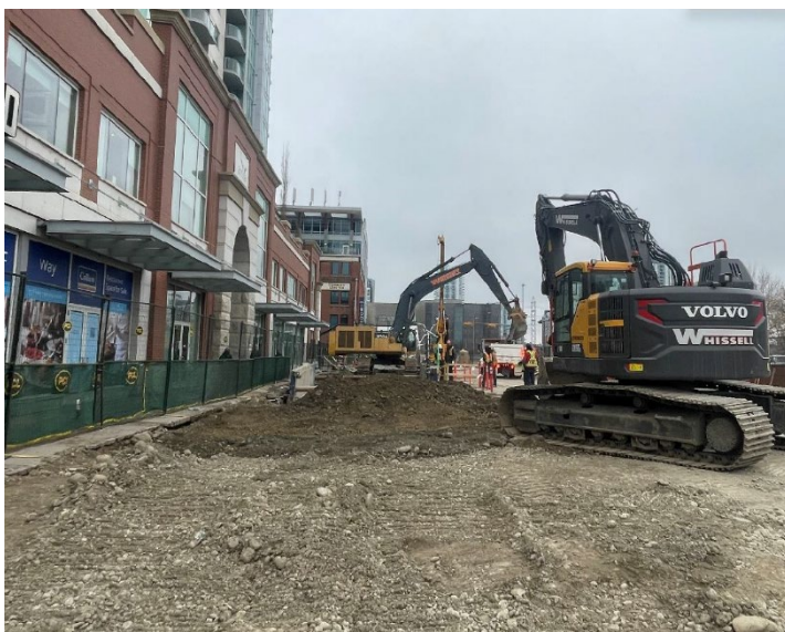
Looking north at deep utility relocation work in Olympic Way S.E., north of 11 Avenue S.E.