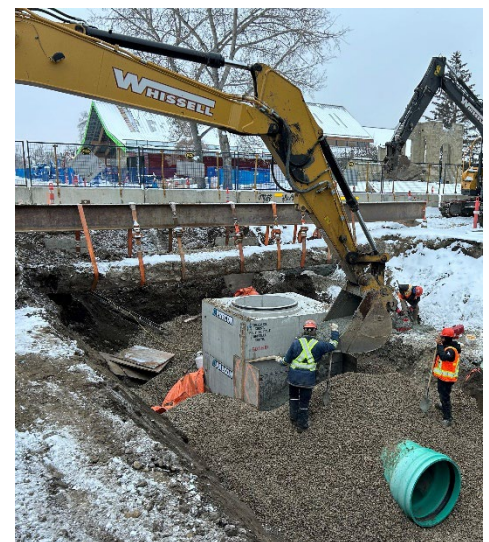
BDURP work in Beltline East.

Excavation work has begun on the original CPKC embankment at 78 Avenue. This excavation includes installing tie backs to the secant pile wall to secure the embankment during the installation of the 78 Avenue underpass structure. Further north, at the location of the future Ogden Station, work began in February to prepare for the installation of the CPKC diversion tracks which is expected to begin in March.