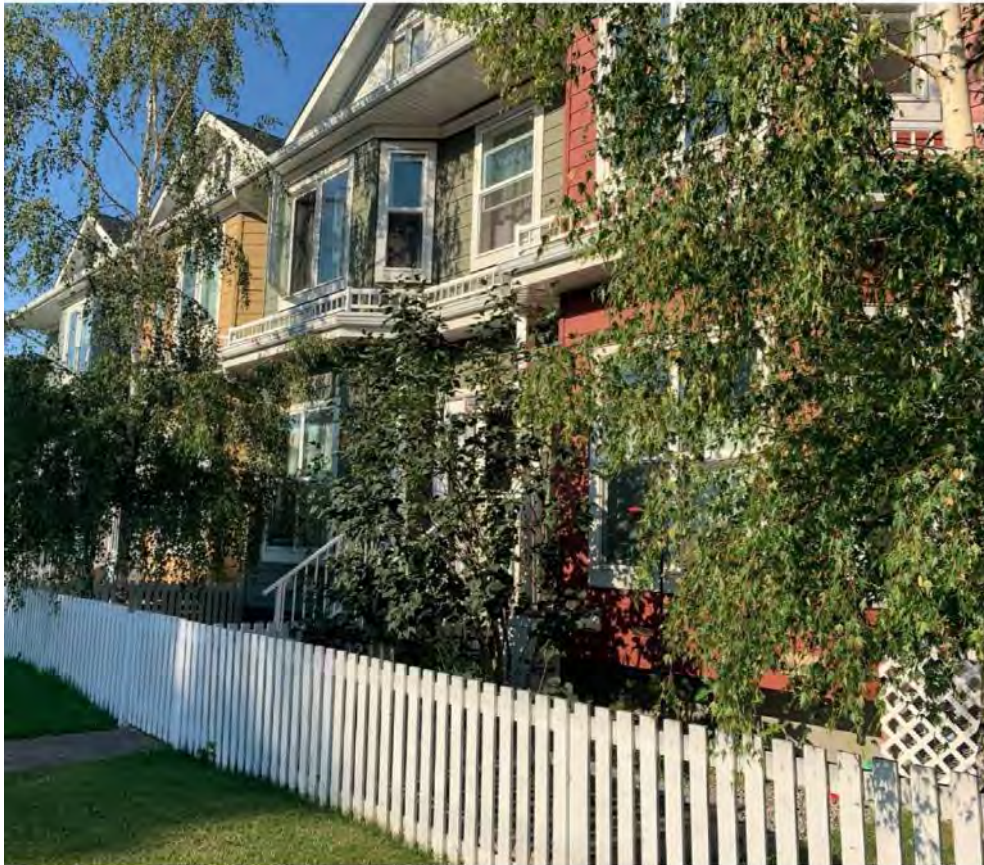
Setback design animates the streetscape and defines semi-private space.

Flexibility in building layout and massing offers the opportunity to design high-quality amenity spaces, setback areas and streetscapes. Locate buildings and upper storey massing to maximize sunlight access for amenity spaces and neighbouring parcels and provide space for layered landscaped areas and complementary setback and streetscape design. Consider the location of adjacent yard space and buildings. Where feasible, align buildings with neighbouring buildings, and amenity spaces and landscaped areas with neighbouring yards.