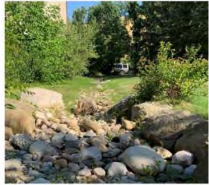
Stormwater management strategies can be a feature in landscape design.