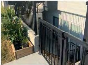
Below-grade amenity spaces are set back from the public sidewalk and screened with planting to provide privacy while maintaining access to daylight and view above.