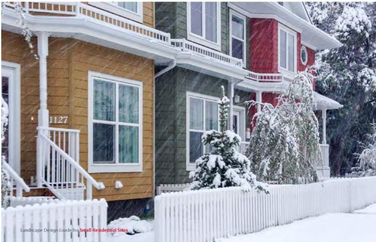
Landscape Design Guide for Small Residential Sites

A comprehensive design process for small residential sites creates urban landscapes that promote well-being and contribute to healthy urban ecosystems. Residents can easily understand what amenity spaces are available to them, enjoy programming that is provided and are able to care for the outdoor spaces around their homes. Residents and visitors alike feel welcomed and safe, while outdoor spaces are animated and enhanced with architectural and landscape elements rich with dynamic plant and wildlife communities.