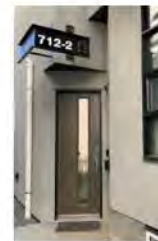
Generous pathways that connect to the public sidewalk, enhanced with planting areas and unique address signs, lead residents and visitors to units accessed from the outdoor amenity space.